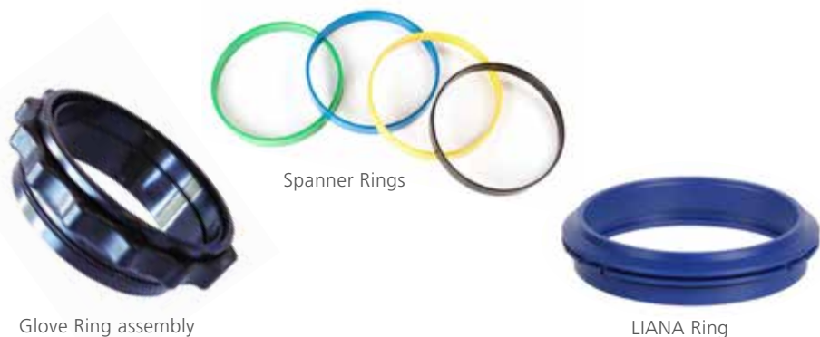
Glove Ring assembly

We want to congratulate you on the purchase of LIANA, a Dry Glove System developed and manufactured by SI TECH in Sweden. LIANA is a user friendly and versatile squeeze-on system. SLÄGGÖ Flex Ring works as attachment platform for LIANA.