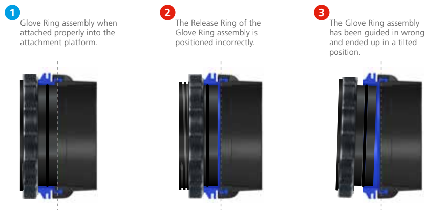
Illustration no.1 is correct! The other examples are incorrect.

The LIANA has a user friendly design but needs to be handled properly to perform as intended. Following explanations have been made using the SLÄGGÖ Flex Ring attachment platform. Some of the problems explained can occur, as well as be solved in the same ways, when using the Quick Cuff or Quick Clamp as an attachment platform for Quick Glove.