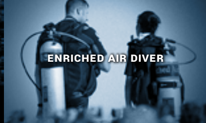
ENRICHED AIR DIVER