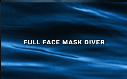
FULL FACE MASK DIVER