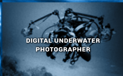
DIGITAL UNDERWATER PHOTOGRAPHER