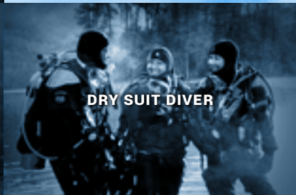
DRY SUIT DIVER