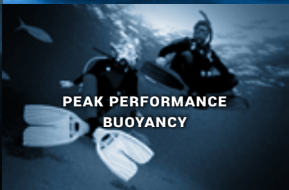
PEAK PERFORMANCE BUOYANCY