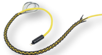
3 - CABLE FLEETER AVOID ANY TRACTION BETWEEN THE SURFACE AND THE UNDERWATER UNIT