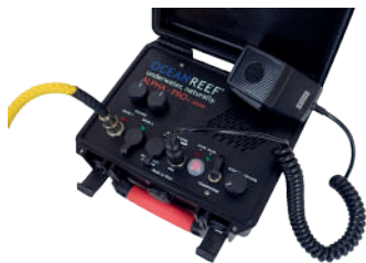
1 - SURFACE UNIT *COMPATIBLE WITH 1.0 UW UNIT