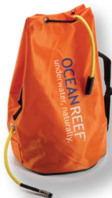
1 - ALPHA PRO X DIVERS BAG THIS BAG IS DESIGNED TO BE INCREDIBLY DURABLE TO CARRY COIL CABLES, IT IS BRIGHT COLORED AND EASY TO SPOT