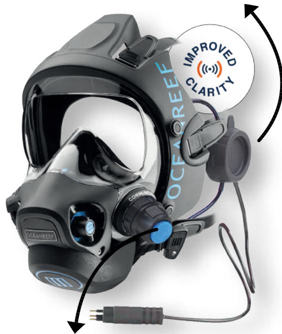
NEW ERGONOMIC AND FULLY INTEGRATED DESIGN BUTTON EASY TO ASSEMBLE ON THE MASK / EASY TO OPERATE