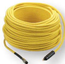
2 - PROFESSIONAL SURFACE/DIVER CABLE *COMPATIBLE WITH 1.0 UW UNIT