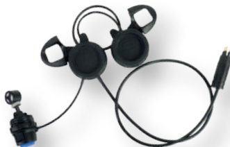
3 - UNDERWATER UNIT 2.0 NEW!